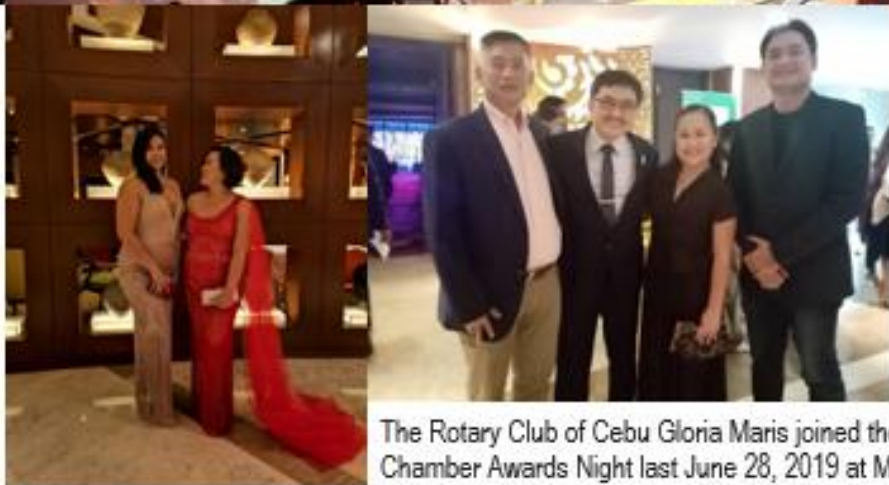
The Rotary Club of Cebu Gloria Maris joined the Grand Chamber Awards Night last June 28, 2019 at Marco Polo Plaza Cebu.