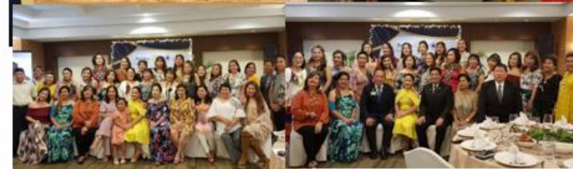
28th Induction and Turnover Ceremonies of the Rotary Club of Cebu Gloria Maris Congratulations and more power to the new set of officers and directors for RY 2019 to 2020!