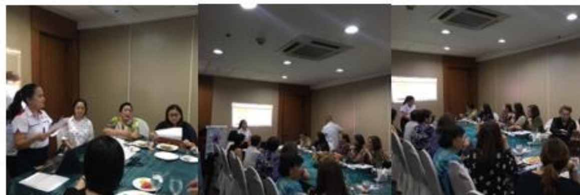
FIRST REGULAR MEMBERSHIP MEETING JULY 4, 2019 7:00PM AT CASINO ESPANYOL