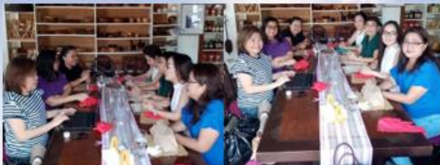
2nd Board of Directors Meeting in preparation for RY 2019 to 2020, held last June 22, 2019.